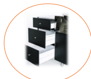
3-Drawers with Blum® Soft Close Runners