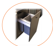
Drawer Mounted 40L Pull-out Twin Bin