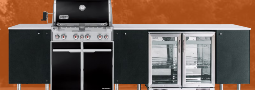
NEPTUNE 4-PODS + 90CM FRIDGE SPACE

SIZE YOUR SPACE Pod sizes are eco-consciously pre-sized and designed to maximise use of materials, minimising waste