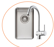
Oliveri® 16L Slim Bowl & Gooseneck Tap