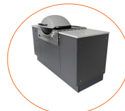
12mm Exterior Grade Board, Colour to Match Cabinet