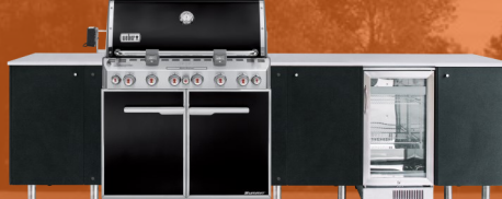
ELSTON 4-PODS + 60CM FRIDGE SPACE