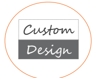
Add Corner or Standard Pods, with Optional Upgrades