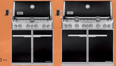
Weber Summit Built In E-460 or E-660 —